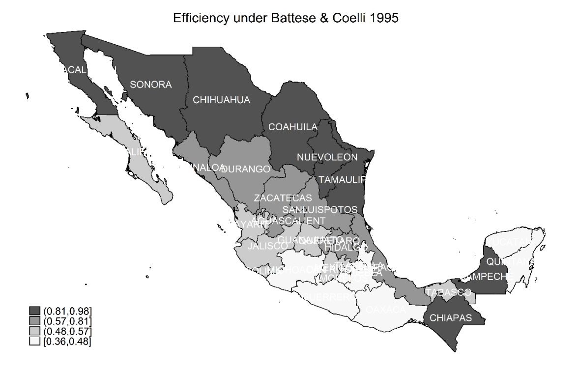
FIGURE I - MAP USING BC95 COEFFICIENTS